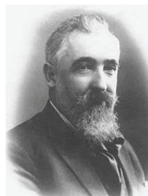
Ion Simionescu (1873-1944)