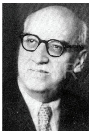
Traian Săvulescu (1889-1963)