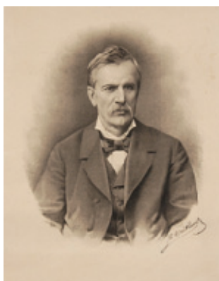
Tytus Chałubiński (1820-1889)