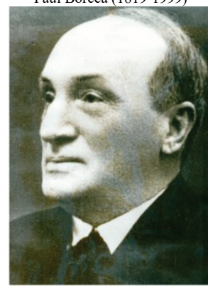
Paul Bujor (1862-1952)