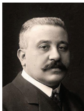
Grigore Antipa (1867-1944)