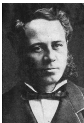
Dimitrie Brândză (1846-1895)